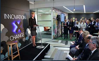
iXc launched in 2015