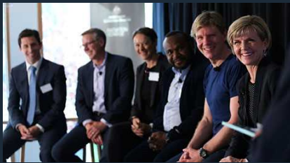
Trialed collaborative Challenge model