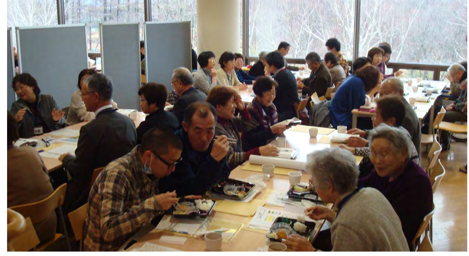
Kawamae Senior Citizen Support Association "Helping each other through the exchange of information on daily life"

(1) Downtown model (2) New town model (3) Urban sprawl model (4) Depopulation and ageing population model