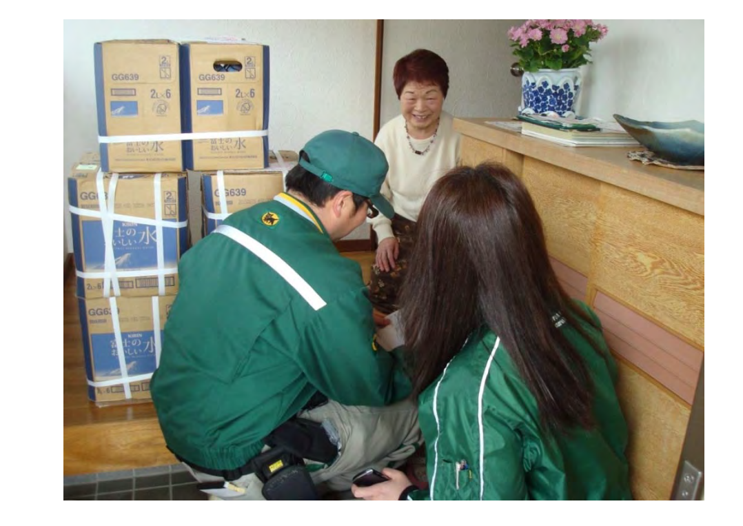
Sincerity in Delivery "Magokoro Takkyubin" "Confirmation of well-being via delivery services"

⇒ Creation of a support network in regional areas