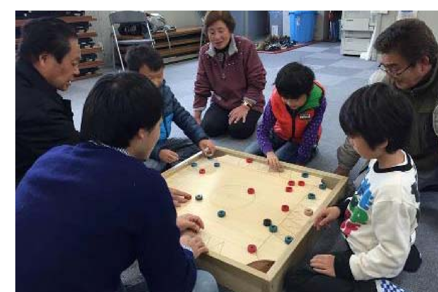
Producing activities by active seniors for support of child-rearing in the disaster-struck area (“Tokyuban” game class)