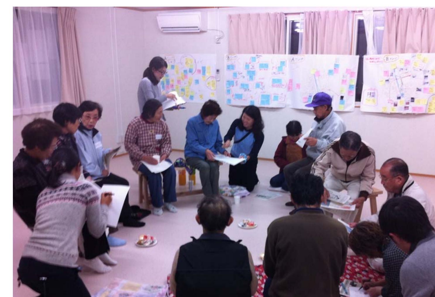
The residential environment inspection method has an effect of recreation of the lost relationship between mutual aid and public aid.