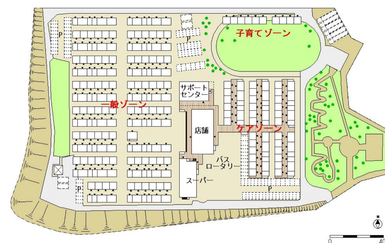
Community care-type temporary housing complex