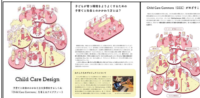
(Extracts from the leaflet)

Taking the survey results into account, we produced a brochure in Japanese in which we present examples of custody sharing as it has been practiced to date and our current thinking on shared parental care.