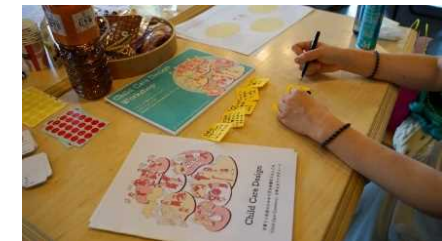
(Photographs from a workshop)