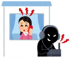
Privacy issues may be salient in Jizai Hon-yaku-ki .

In R&D Theme 6, we analyze the ethical, legal, and social issues (ELSI) involved in this R&D project to make Jizai Hon-yaku-ki socially acceptable.