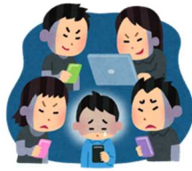
Protecting participants is our utmost priority.

Since Jizai Hon-yaku-ki builds on emerging biology and neuroscience, it may cause various ethical concerns regarding privacy and unfamiliar forms of communication . Also, our highest priority is to protect the rights of participants in our R&D. Jizai Hon-yaku-ki should reduce — rather than worsen — discrimination against people with developmental conditions .