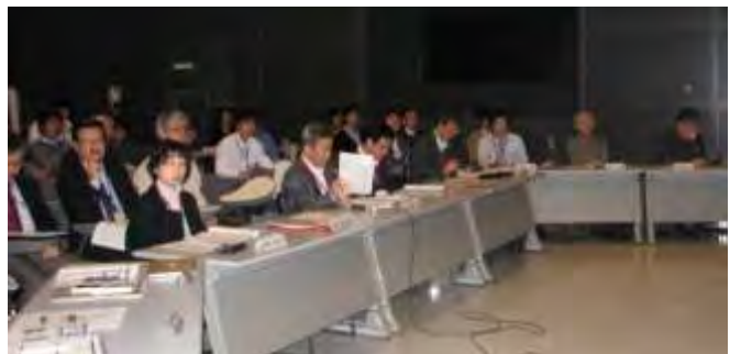
Innovation Hall at Miraikan.