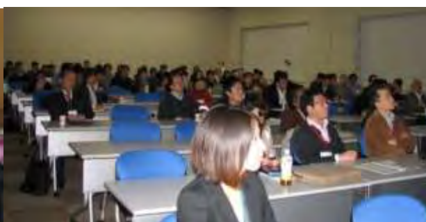
Optional seminar entitled "1 st Theoretical Design Dojo".