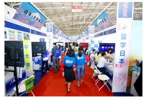
Japan booth area was crowded with Chinese students and business people.

The Academic Hall of the Chinese Academy of Sciences