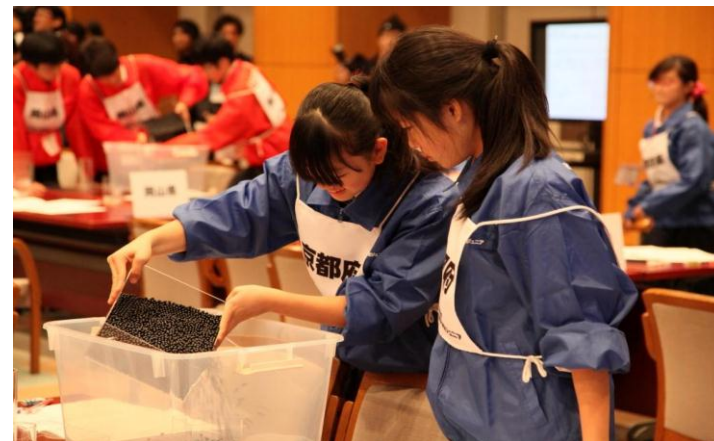
One of the experiments in the 1 st tournament