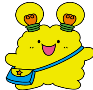
The official mascot of JJHSSC, Appin

Venue: The Sports, Cultural Complex "BumB" (2-1-3 Yumenoshima, Koto-ku, Tokyo)