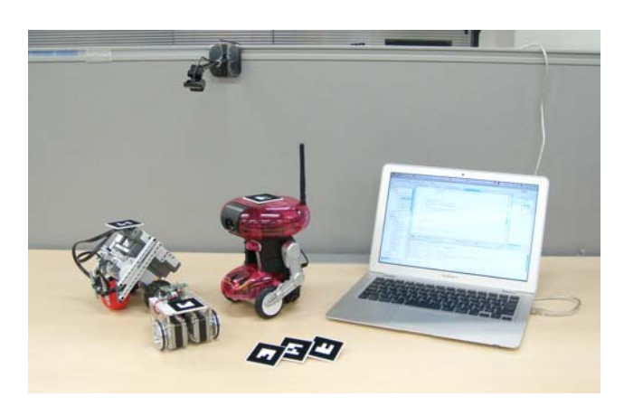
Figure 1 Our toolkit only requires a computer, a web-camera, visual markers, and robots.

Copyright is held by the owner/author(s). UIST'09 , October 4–7, 2009, Victoria, BC, Canada.