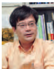
Isamu Akasaki (Professor at Meijo University, Professor Emeritus and Distinguished Professor at Nagoya University)/ Toyoda Gosei Co., Ltd

Development of Creative Technology Seeds, Contract Development